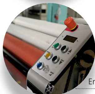
Ergonomic, user-friendly control panel for easy operation