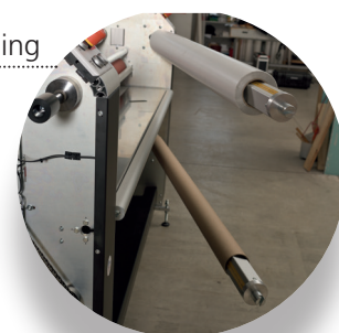
Swing-out autogrip shaft for easy material loading