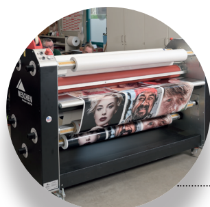
Integrated roll to roll function for higher productivity and less material waste