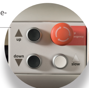
Additional control panel on the back for easy operation by a single operator