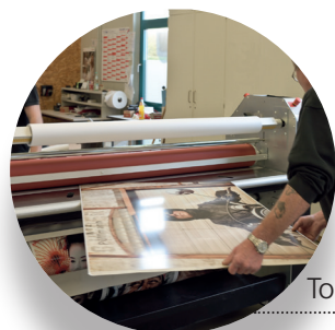
Top-speed of 12 m/min for maximum productivity

Due to its variable pressure and speed adjustments the Neschen HotLam 1650 TH laminator is suitable for new and experienced users who are looking for a particularly powerful laminator, but do not require full encapsulation function. The Neschen HotLam 1650 TH has a technically sophisticated roller system with a high maximum contact pressure. This provides excellent results for each desired application.